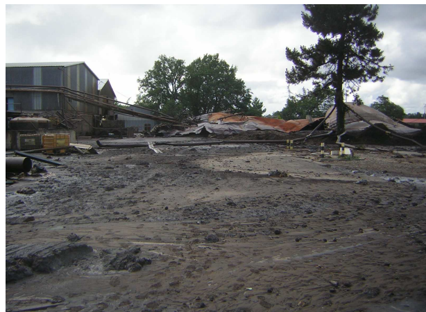
Photographs of the tank taken before and after the accident