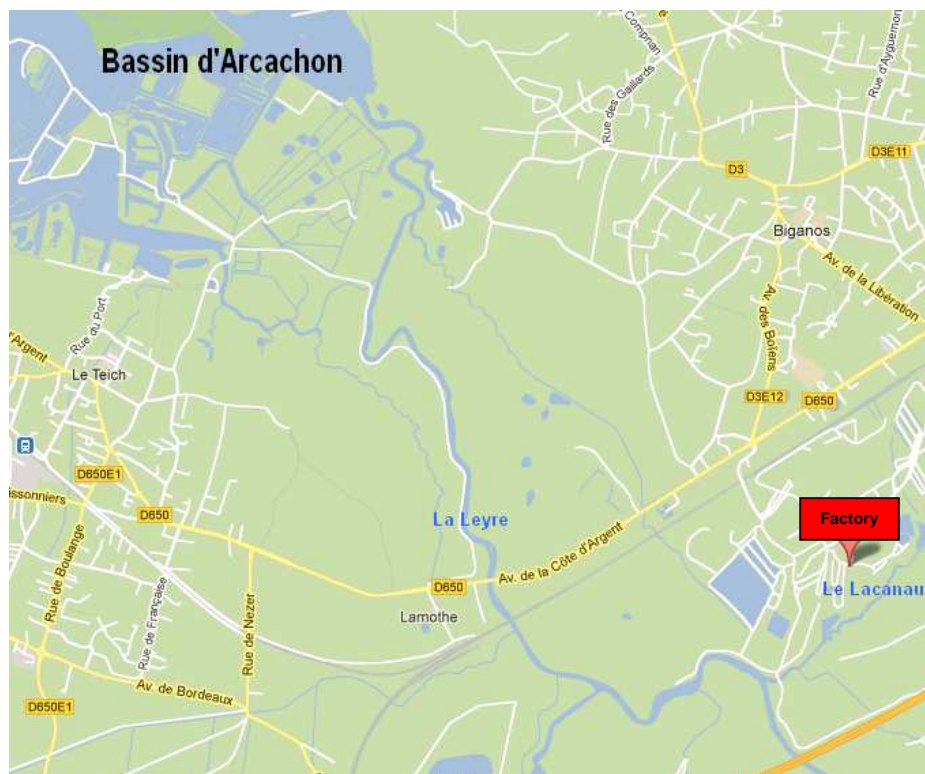
Map of the vicinity

This factory, located 2 km from the Biganos Port at the mouth of the Leyre River on the Arcachon Basin, is immediately adjacent to the Grande Leyre and Petite Leyre valley (listed as a Natura 2000 protected site). Effluent discharged by the onsite stormwater treatment plant as well as at municipal treatment plants around the Basin was being released into the Atlantic Ocean via a collector pipe operated by the Arcachon Basin Joint Municipal Authority (SIBA).